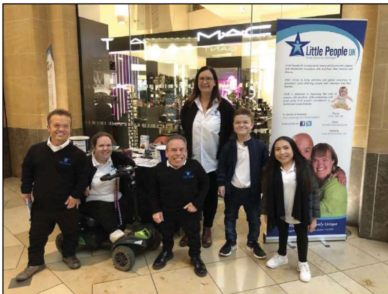
Warwick and his charity Little People UK who raise awareness about prominent issues affecting people with dwarfism and their families.

The event raised funds and awareness for the charity Little People UK with total footfall on the day of 50,254.